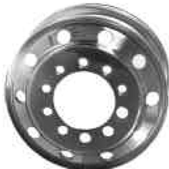
10-Hole AKW Hub Pilot