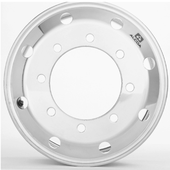
8-Hole ALCOA Hub Pilot

RPO PNB: Both inner and outer rear wheels are aluminum and polished on both sides.