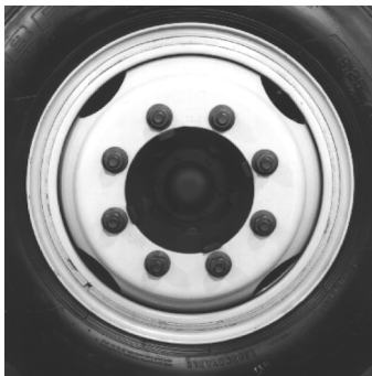
8-Hole Hub Pilot