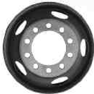
10-Hole Hub Pilot