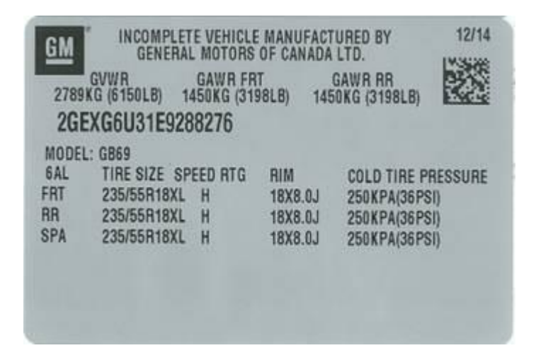
SAMPLE: W30 chassis IVD Label

Please contact Ray Bush with any questions.