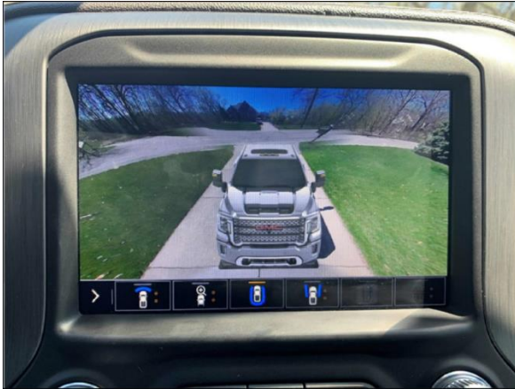
Frontend view, Tailgate equipped

The following are examples of camera views with the tailgate equipped normally and with the tailgate removed and the masked camera and harness installed.