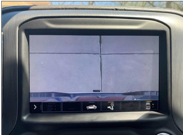
Trailer hitch camera, Tailgate equipped