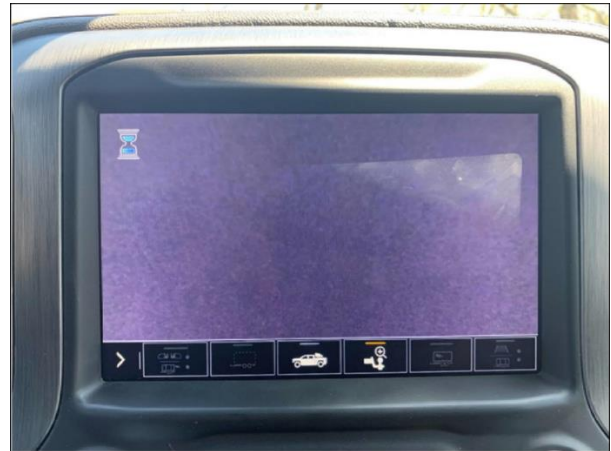
Trailer hitch camera, Tailgate removed