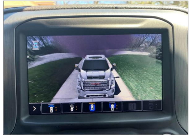
Frontend view, Tailgate removed