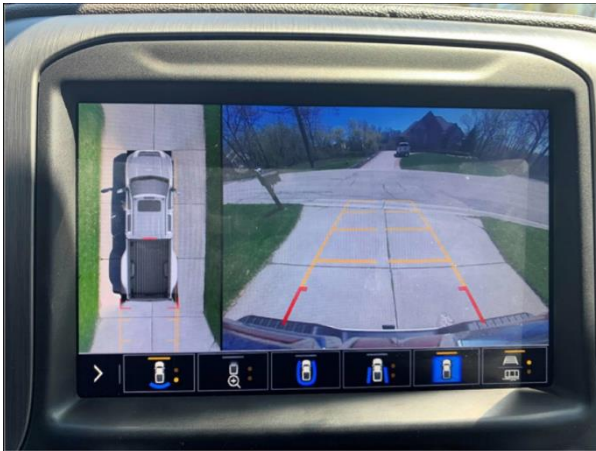
Tailgate backup camera, Tailgate equipped