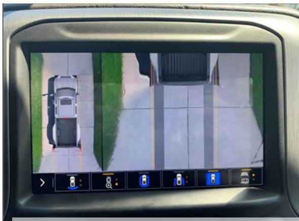
Tailgate Overhead view, Tailgate equipped