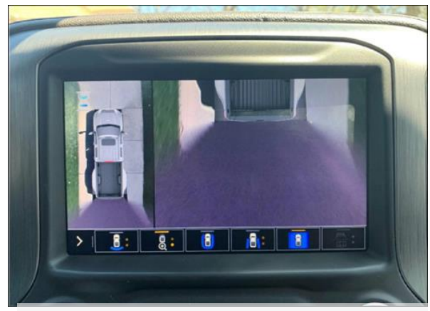
Tailgate Overhead view, Tailgate removed