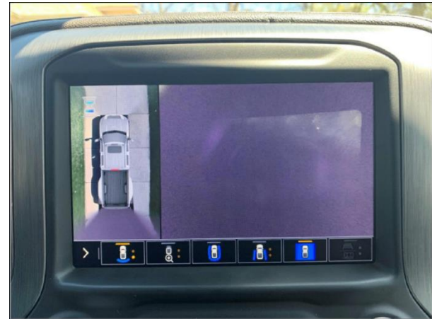
Tailgate backup camera, Tailgate removed